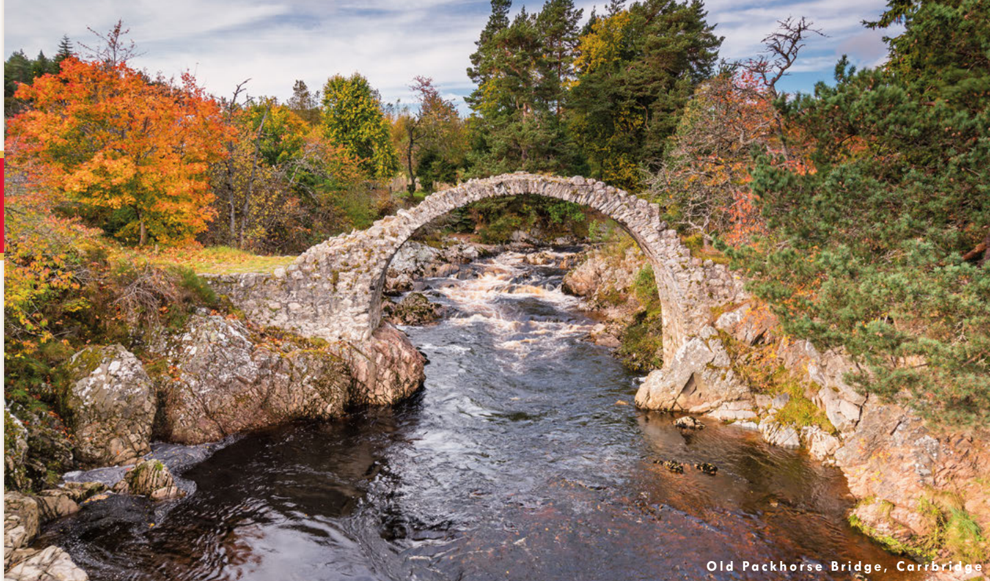
Old Packhorse Bridge, Carrbridge