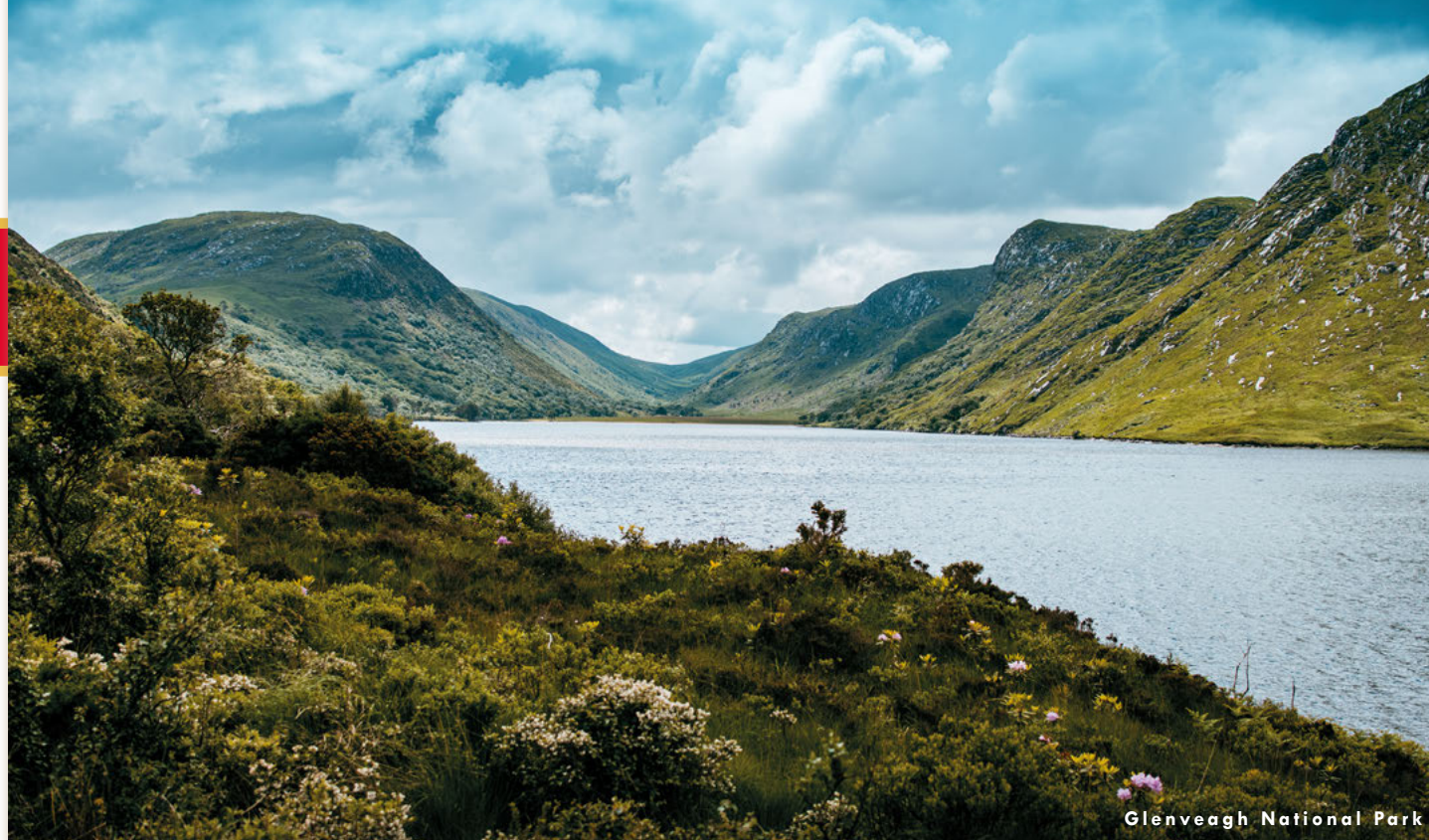
Glenveagh National Park