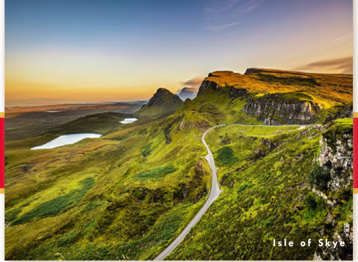
Isle of Skye