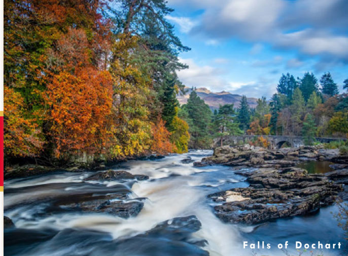
Falls of Dochart