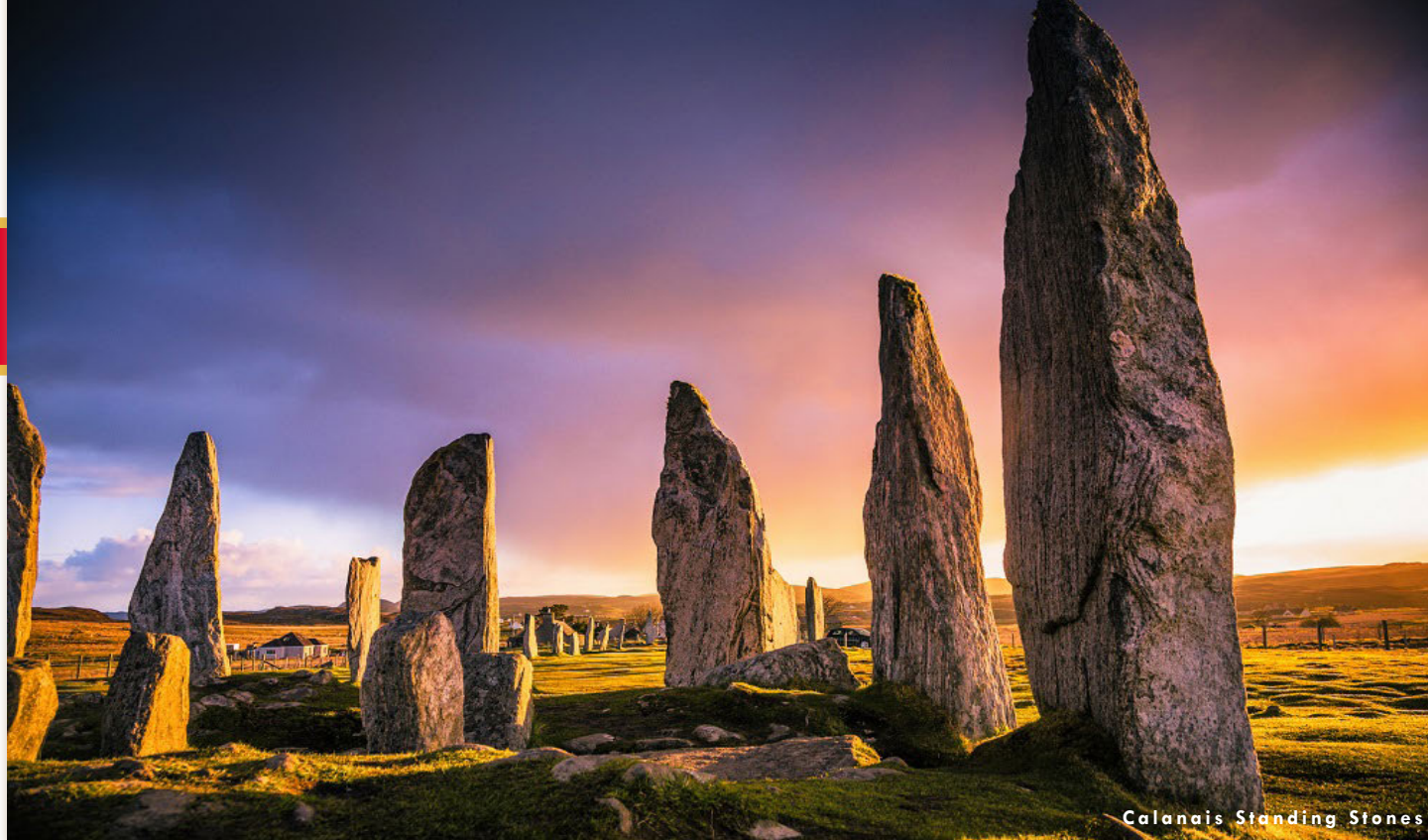
Calanais Standing Stones