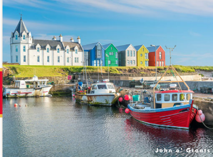
John o' Groats