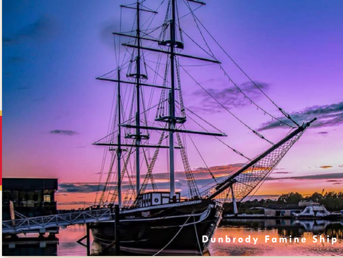
Dunbrody Famine Ship