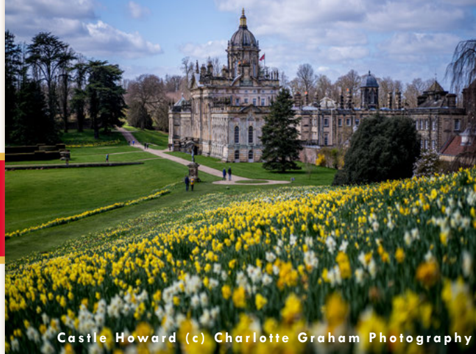
Castle Howard